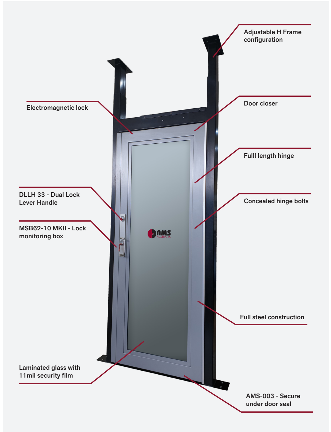
PSDS - Perimeter Security Door Solution