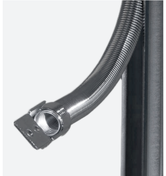
Spring Internal View